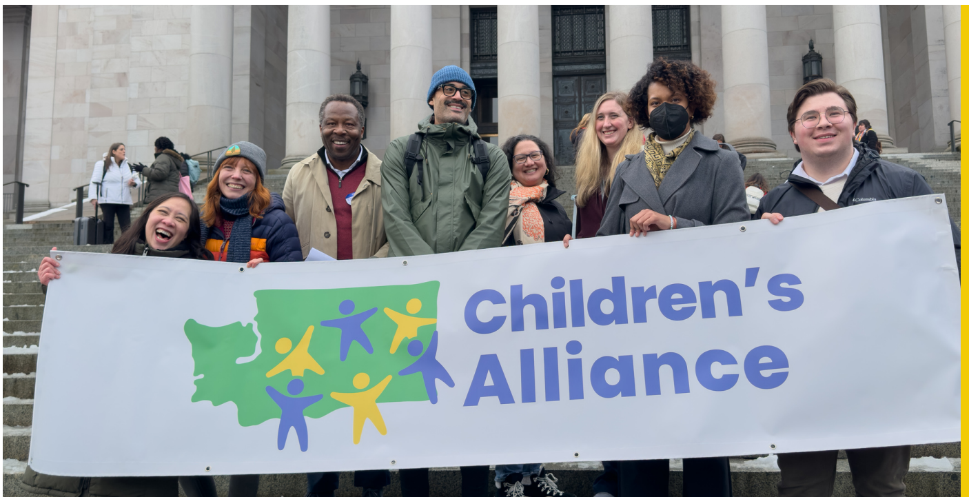
Children's Alliance team at Have a Heart for Kids Day

We are eager to continue the work on these important policies in 2025. Continued advocacy, often over many years, is necessary to implement large-scale, systemic change.